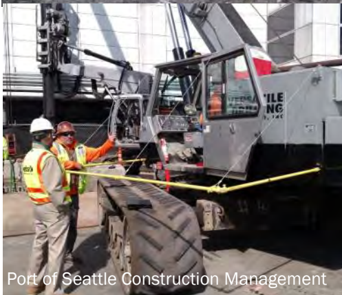
Port of Seattle Construction Management