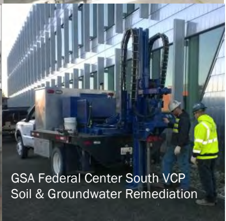
GSA Federal Center South VCP Soil & Groundwater Remediation