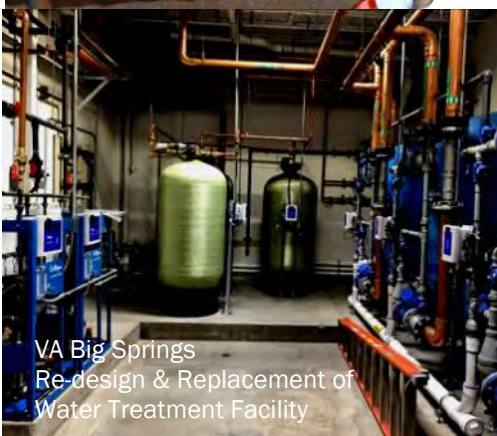
VA Big Springs Re-design & Replacement of Water Treatment Facility