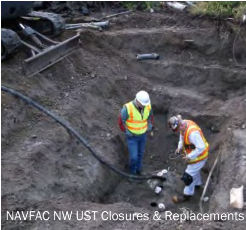
NAVFAC NW UST Closures & Replacements