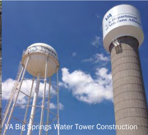
VA Big Springs Water Tower Construction