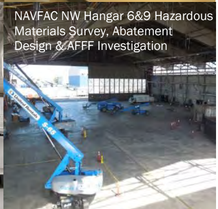
NAVFAC NW Hangar 6&9 Hazardous Materials Survey, Abatement Design & AFFF Investigation