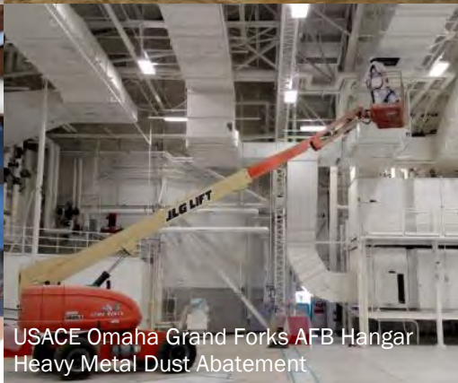
USACE Omaha Grand Forks AFB Hangar Heavy Metal Dust Abatement