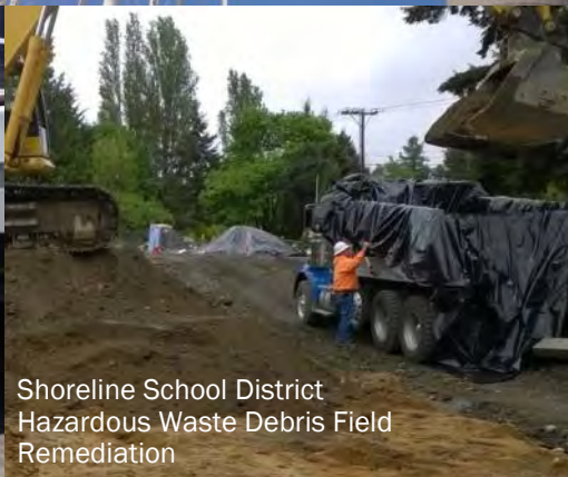
Shoreline School District Hazardous Waste Debris Field Remediation