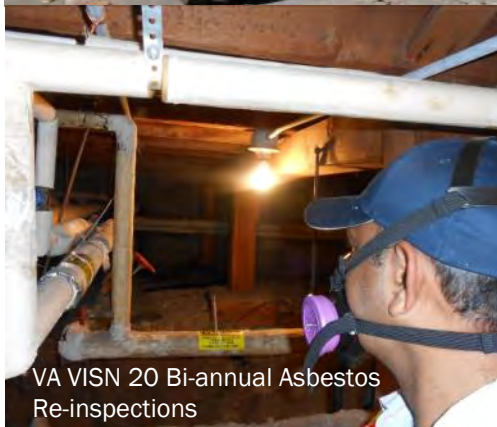
VA VISN 20 Bi-annual Asbestos Re-inspections