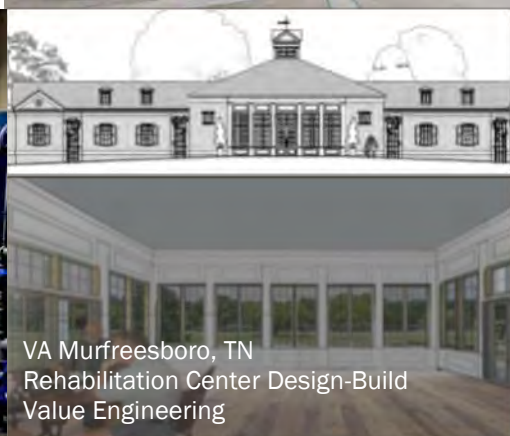
VA Murfreesboro, TN Rehabilitation Center Design-Build Value Engineering