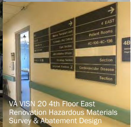
VA VISN 20 4th Floor East Renovation Hazardous Materials Survey & Abatement Design