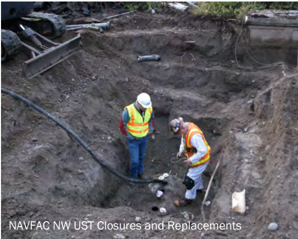
NAVFAC NW UST Closures and Replacements