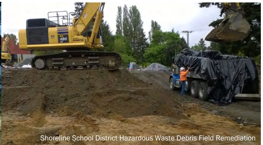
Shoreline School District Hazardous Waste Debris Field Remediation