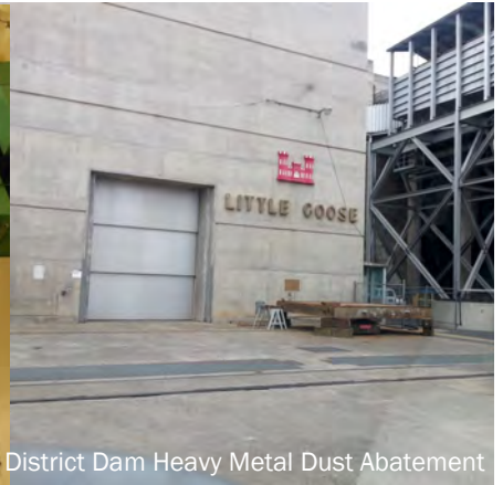
USACE Walla Walla District Dam Heavy Metal Dust Abatement